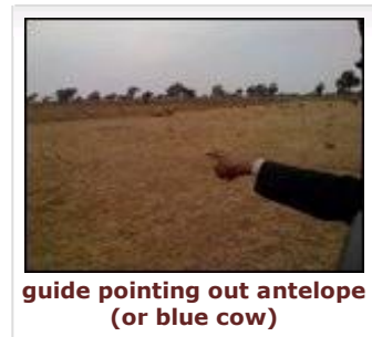
guide pointing out antelope (or blue cow)

beautiful sheets, duvets, etc... After the textile factory, we dropped off our guide (gave him a tip) and were driven to the airport for our trip to Udaipur.