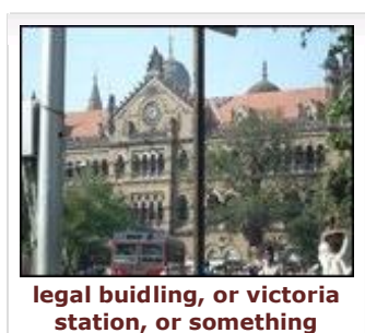
legal building, or victoria station, or something

Next we drove through many parts of Mumbai with Avi providing commentary on the buildings and history and what went on there. There were a lot of rotary circles to drive through so it's easy to get turned around.