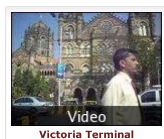
Video Victoria Terminal

Many of the buildings were giant Victorians from the British era. Other interesting buildings look almost entirely new, even giant skyscrapers, with a tiny appendage that looks like an old house—the story here is that by building these giant skyscrapers as “additions” to existing structures they're able to get around building codes or tax laws or something.