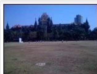
cricket in front of legal center

Directly outside the museum was an art fair – one that Avi had mentioned the previous day. We wandered around