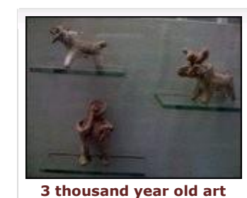
3 thousand year old art

We had bought some bottled water on the way, but had to check the bottle before entering the museum. The Prince of Wales museum was impressive outside and in. The building itself looks like an old Victorian building