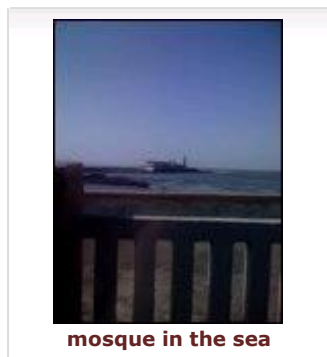
mosque in the sea

After lunch, Avi had an appointment, so we tagged along. We dropped Avi off