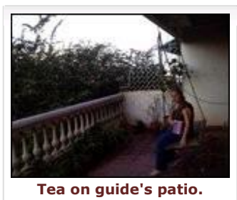
Tea on guide's patio.