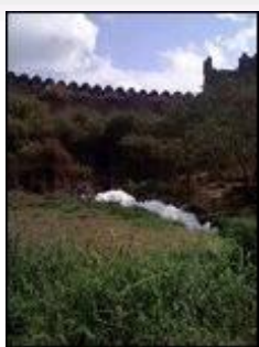
Ho Ho Ho. Where Santa gets his foam.

water went through some factories, and so in places we saw so much foam in the water that it looked like isolated snow piles. Also probably not on most tours, we drove past a low-income housing project (one-room houses and larger plots but with no bathrooms).