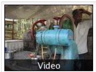
Video Pressing sugar.