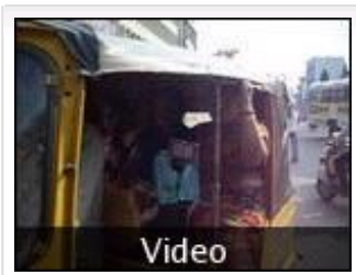
Video Typical city traffic.

We next drove through various sections of the downtown part of Hyderabad. From the top fort we went through the “old old city” of narrow alleyways (especially narrow for Abbas’ big jeep) inside the fort, then through the “old city”, then out to just the “city.” Along this tour we viewed a few Muslim temples, the High Court, Charminar, and vendors selling everything under the sun (from old old stalls in old old city, to rows of dense stalls in old city, to malls in city). We took a tour break at Minerva Coffee House for lunch. Very clean. Abbas had dosa, Amy has a cheese sandwich, and Naresh had a thick pancake like bunch of dough and peppers and onions.