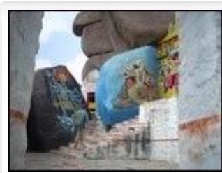
Hindu temple painted on boulders.

hike around the fort was over, the sun had come out in full force, and Amy realized that she had gotten a sunburn.