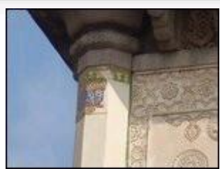
Tombs. A little bit of the old tile remains.

We drove past many huge boulders huge (2.5 million years old) for a beautiful view of the city. From the overlook, we had seen a fort in the distance, which was Golconda Fort. This fort had been built by the (Muslim?) kings ruling the area, and later expanded with a send outer wall to prevent Arengzeb (same guy was in Delhi, Agra, and Aurangabad) from conquering it. That didn't work. Aurangzeb expanded his dynasty to Hyderabad, capturing the last independent ruler of this region and