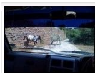
A cart and bull story.

and this one baobab tree had survived). We also went to see the wetlands around the fort where very many birds lived, water buffalo grazed, and people cut down the long grasses for sale and carted them in for sale on bull-drawn bullocks. Before reaching these wetlands the