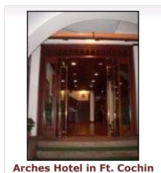
Arches Hotel in Ft. Cochin

We were shown upstairs to our room, which was lovely, with Keralan cherry wood and white walls, t.v, fridge, shower, air conditioning, fan, and 2 windows.