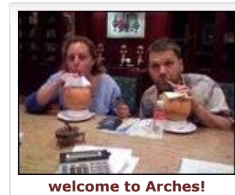
welcome to Arches!

We drove through several towns on the way to our hotel, which was in the fort section of Cochin. We were excited to see a hammer and sickle b/c we had heard that the state of Kerala had communist leanings. The fort section was different than any other place we had seen in India and much quieter & cleaner.