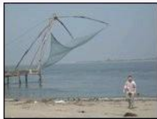
Brent under a net

strung between extended logs, counter balanced by more extended logs and counterbalanced by large boulders. Quite big. We couldn't figure out how they worked and would have to wait until high tide to learn.