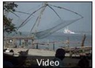
Chinese fishing net video

We wandered along south, along the west sea wall of the peninsula that is Fort Kochi, seeing the sights, meeting many friendly people, and enjoying the sea and breeze. We didn't have many goals for the day, other than to get to Jew Town and see the synagogue and Jewish-named shops there. Mostly we just liked saying “Jew Town” and getting away with it (take that, Jesse Jackson). It was a mile, or two, or three to Jew Town, and we walked the whole way. Along the way we found more Christian churches than we've seen elsewhere, goats on the beach, a Dutch cemetery with raised coffins much like in New Orleans, a higher percentage of whities than anywhere else we've yet visited, elephants being loaded on trucks that drove down the street barely scraping the elephant backs under electrical wires, Mother Theresa in a glass case, running sewage-smelling gutters like we'd remembered from Burkina Faso, and some of this and a lot of that. We also saw them decorating a temple and streets with lots of color and lights—it looked like there were set up for a procession and we decided to come back at night to watch it.