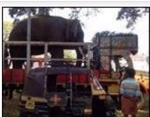
elephant preparing for Hindu festival

We wandered along south, along the west sea wall of the peninsula that is Fort Kochi, seeing the sights, meeting many friendly people, and enjoying the sea and breeze. We didn't have many goals for the day, other than to get to Jew Town and see the synagogue and Jewish-named shops there. Mostly we just liked saying “Jew Town” and getting away with it (take that, Jesse Jackson). It was a mile, or two, or three to Jew Town, and we walked the whole way. Along the way we found more Christian churches than we've seen elsewhere, goats on the beach, a Dutch cemetery with raised coffins much like in New Orleans, a higher percentage of whities than anywhere else we've yet visited, elephants being loaded on trucks that drove down the street barely scraping the elephant backs under electrical wires, Mother Theresa in a glass case, running sewage-smelling gutters like we'd remembered from Burkina Faso, and some of this and a lot of that. We also saw them decorating a temple and streets with lots of color and lights—it looked like there were set up for a procession and we decided to come back at night to watch it.