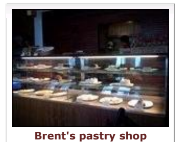
Brent's pastry shop

email, talked with a guy at the front desk about how to get a bus tomorrow to our next destination, and took a shower (lots of showers because we get damp very quickly here)], but I got to see a couple miles of various businesses and homes along the waterway. Getting very hot again I was pulled into an air-conditioned cake shop for cake and tea. On leaving my bill was 70 rupees, but the close I had was a 100-rupee bill. It was time for a Rupee Standoff, which is what happens when change is needed in India. The customer says "I don't have change," and the business says "I don't have change," and both sides shrug their shoulders for a while, dig in their pockets, look around, and practice their helpless look until someone caves in either by finding the change (that they knew was there all along), or by fetching change from somewhere else, or by upping or lowering the price, thus losing at Rupee Standoff. (There's probably a prize in economics waiting for someone to explain how much a single rupee is really worth, given that people will change the price of something by at least 10 rupees if it can avoid having to deal with change.)