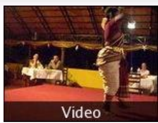
Video Keralan dancers

During dinner we were treated to a dance show. Three women (Amy says it was two) took turns dancing. It looked like Thai dancing (although I've never seen Thai dancing, so I don't know why I say that) with an Indian drum-bases soundtrack. Good stuff, and the food was good too.