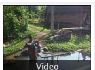
Video view of backwaters from boat