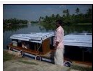
ready for boat ride

The three-hour cruise was relaxing and fun (and beautiful- a glimpse into life on the backwaters) Kelly and I chatted and we learned about their trip and adventures in India. They had