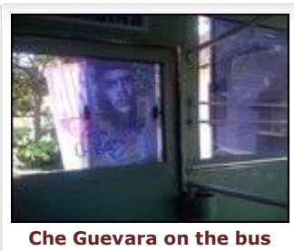
Che Guevara on the bus

Alleppy. A few minutes later, a bus to Alleppy came (we double-checked with the driver to make sure Alleppy was the destination—he bobbed his head in a way that we thought was not a no) and we boarded another bus to Alleppy. We paid the ticket taker 36 rupees per person, and were on our way. The ride was pleasant and shorter than we had thought. The travel person at Hotel Arches had said that the ride to Alleppy by bus would take 2.5 hours, 1.5 by car.