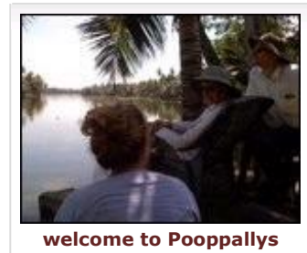
welcome to Pooppallys