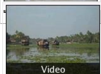
Video houseboat traffic jam