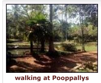
walking at Pooppallys