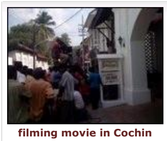
filming movie in Cochin

shooting a movie with lights, and an actor, who looked like Placido Domingo, on a balcony.