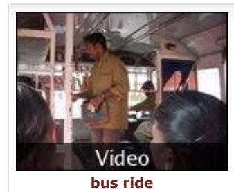
Video bus ride

We walked to the bus stop, near the fishing nets, and, after figuring out which side to board the bus, we asked the driver if he was going to a bridge (I forget the name) where we had to catch another bus to Alleppy. He bobbed his head (a "yes" gesture? or no?) so we boarded the big red bus. A few minutes later, a ticket taker came buy and collected our money (10 rupees total for both of us). We drove about 10 minutes, listening to the buses loud sound system all the way, until the ticket-taker man gestured to us that the bus had reached our stop. We got off the bus and asked a few people where to catch the bus to