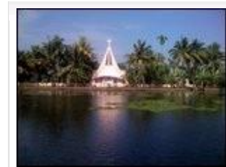
church in backwaters

were all excited to see a hammer and sickle on flags, and one painted on a wall (the Communist party is strong in Kerala. We were able to sit on top of